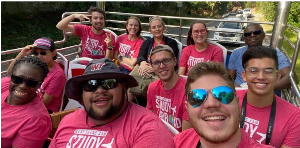
Cape Town, South Africa

Here in our office, we believe studying abroad contributes greatly to our development as individuals, as students, and as professionals. We see that experiences gained abroad are unmatched and continually built upon. With a refined perspective and understanding of the world from studying abroad, we see students adapt and incorporate other cultural values back into their life in the U.S.; we see students serve their communities well, and we see students discover parts of the world and themselves worth being proud of. We encourage you to be patient with the current state of our world and to never give up on studying, researching, interning, volunteering, and traveling abroad.