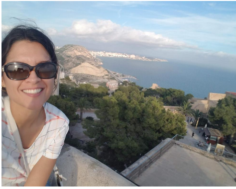
Castillo de Santa Barbara: Alicante, Spain